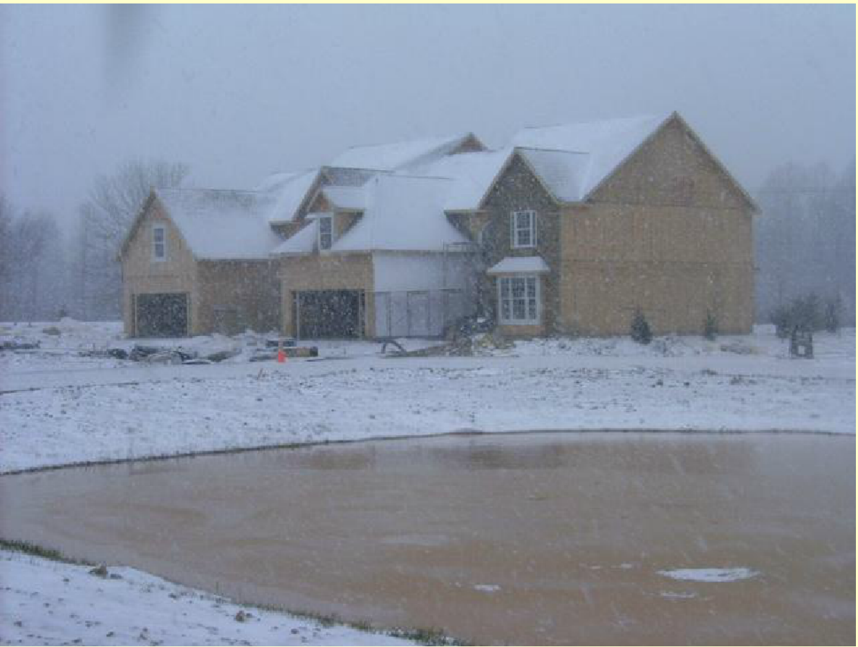
December 2004 Casa Villa Units 2 & 4