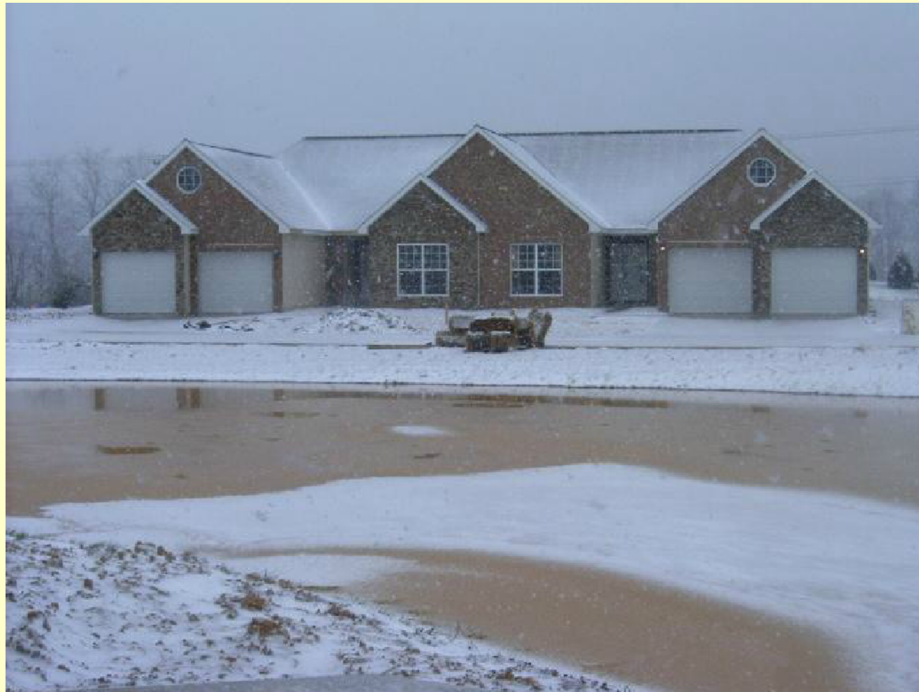
December 2004 Ranchero Model Units 84 & 86