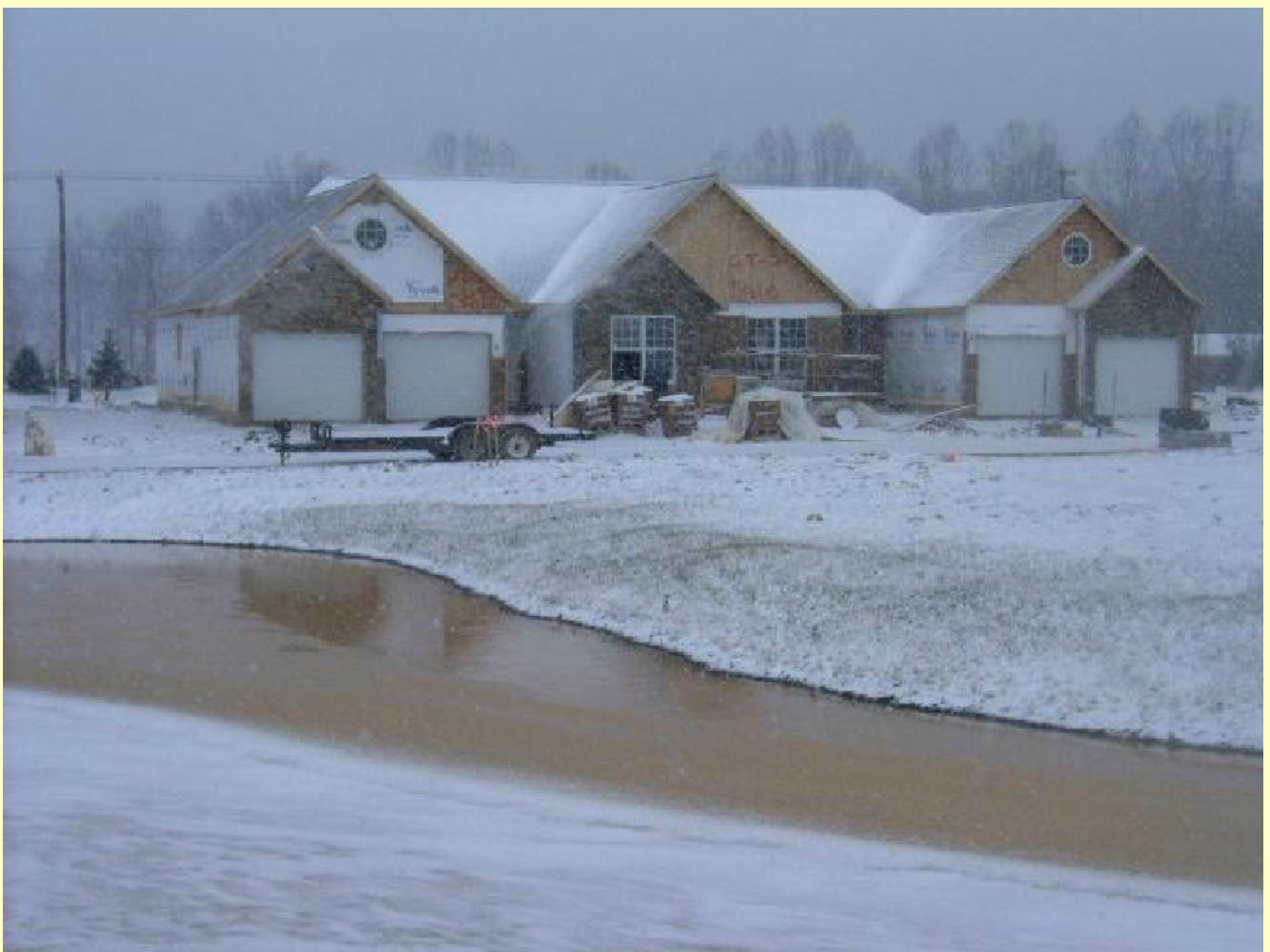
December 2004 Ranchero Units 80 & 82